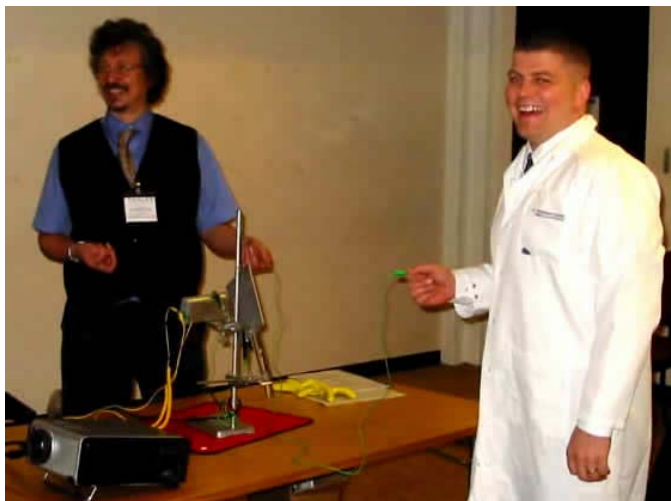
Finding the static voltage on your body can be quite surprising!